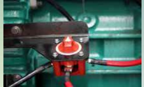
Battery Isolator Switch