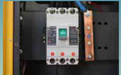
3P Output Breaker Switch