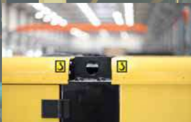
Balance Points of Canopy Top