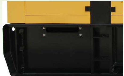
Power Cables Port