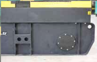
Beval Angle and Drag Holes