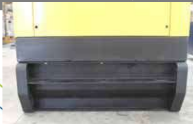
Beval Angle and Drag Holes